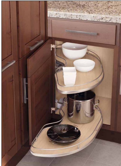
Right Hand unit shown