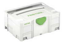
Systemer Sys-2 T-LOC