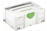
Systemer Sys-2 T-LOC