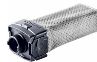
Longlife dust bag