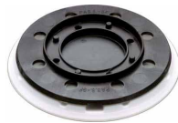
StickFix Soft Sander Backing Pad